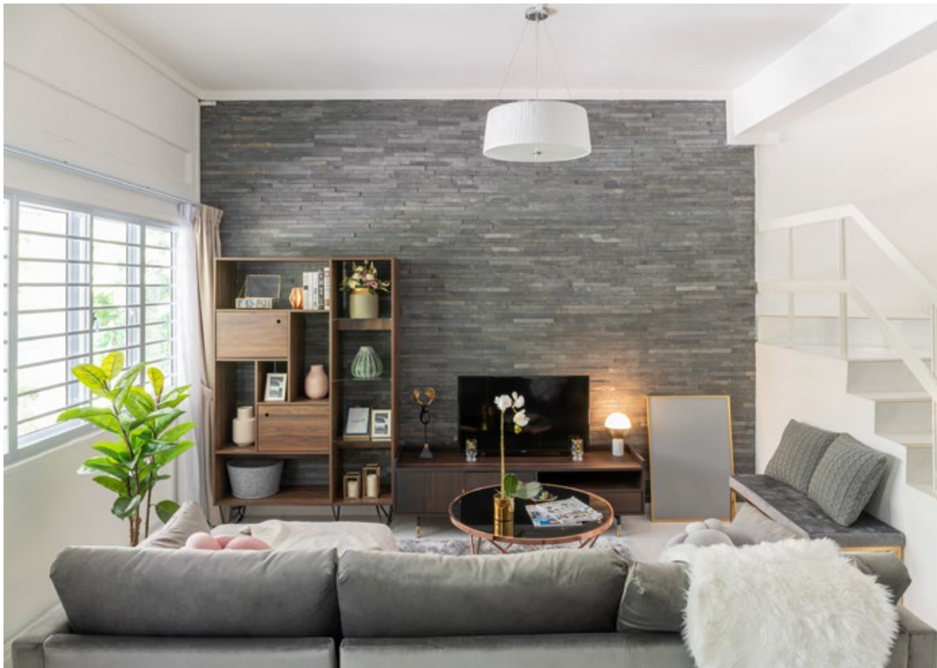
Different shades of grey, the primary colour for the living room, stand out against the show house's white backdrop

Brimming with charismatic cafes and quaint boutiques, Chip Bee Gardens' serene neighbourhood is one of the most sought-after areas in Singapore. Its strategic location of being close to Holland Village MRT station, schools and the delights of Holland Village are what draws many prospective residents to the area.