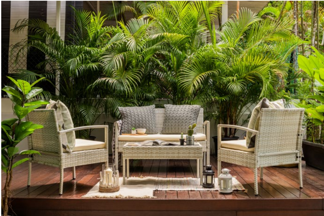
Luscious greens and rattan garden furniture decorate the show house's outdoor porch, transforming it into a fashionable lifestyle enclave