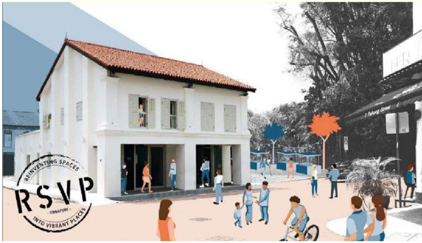
RSVP aims to make areas more vibrant by enhancing them to encourage community activities and bonding