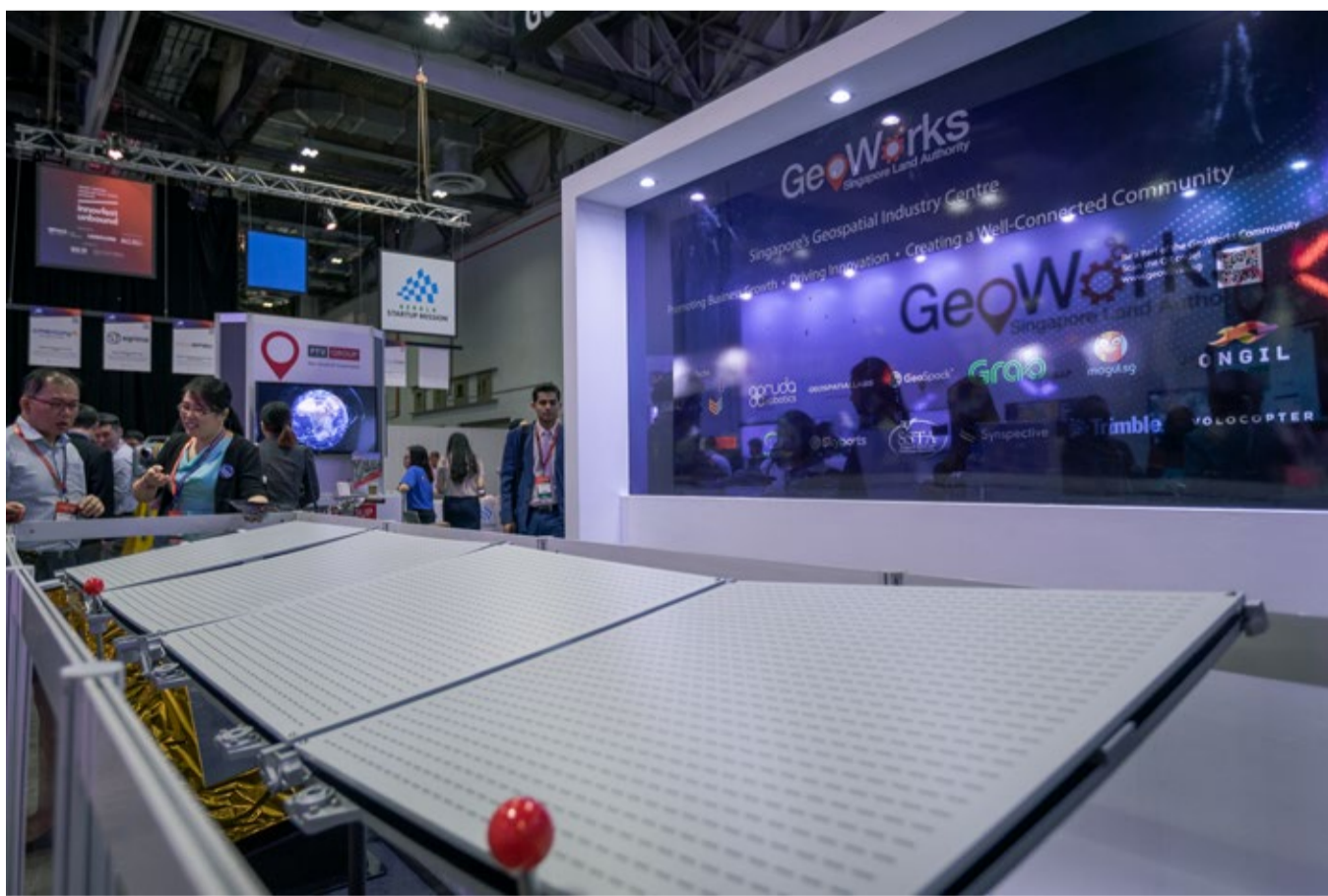
Synspec displayed their soon-to-be launched Synthetic Aperture Radar (SAR) satellites - that enable efficient and accountable construction monitoring, urban development assessment and subsidence monitoring - at the GeoWorks showcase