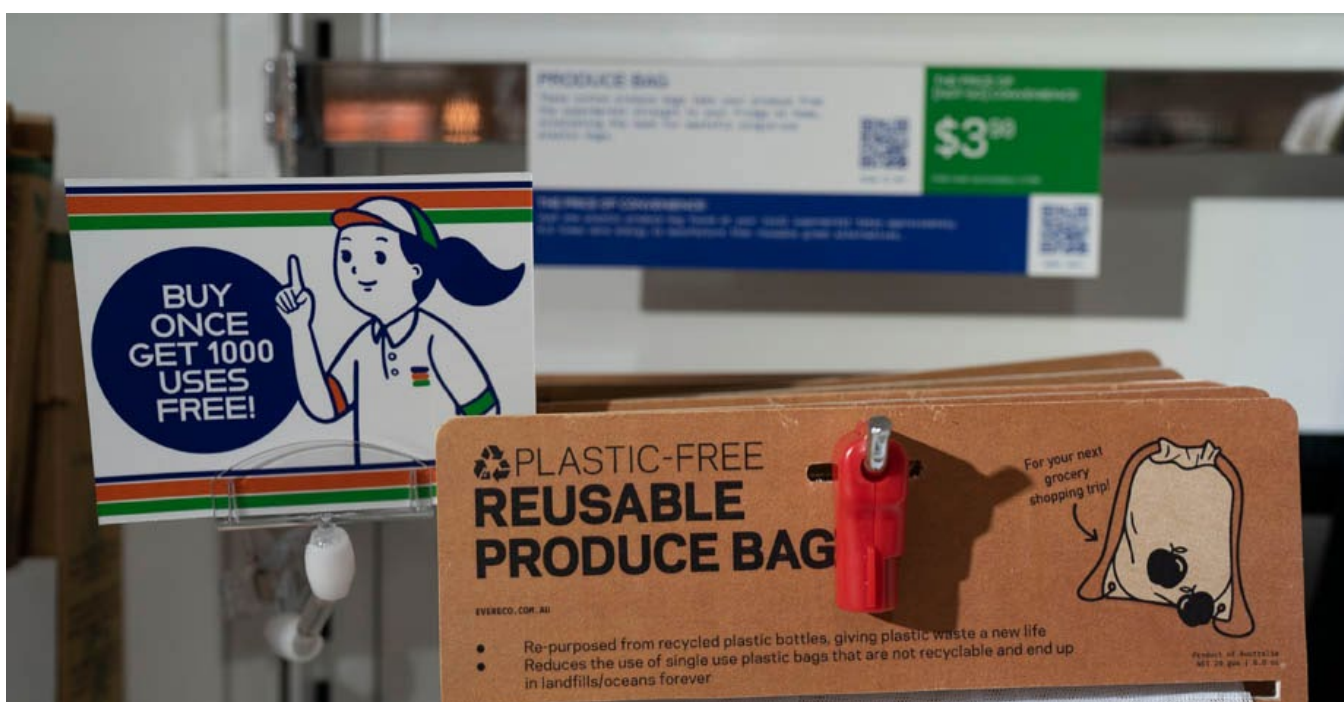
Saving the environment with reusable, non-plastic products is the main focus at the “[Not-So] Convenience Store”, not the customer

Lined up neatly along pristine shelves are your average, everyday products - with a twist. Bamboo toothbrushes, compost buckets, solar chargers; every item a re-usable and sustainable alternative to their all-too-familiar disposable counterparts. Global conversations sparked by initiatives such as these are vital towards generating awareness. In 2017, Singapore alone generated 7.78 million tonnes of waste, and the worldwide figures climb higher each year.