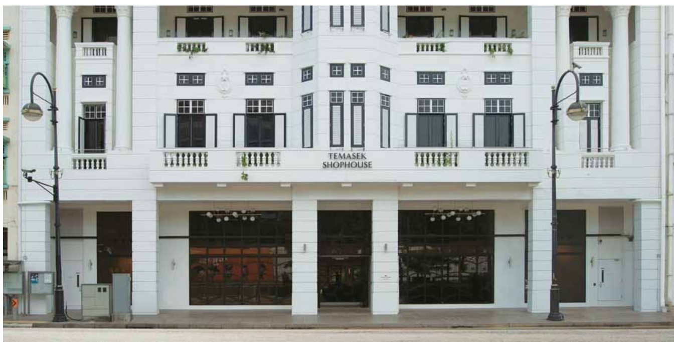
The newly converted Temasek Shophouse is a communal co-working space that encourages philanthropy and sustainability