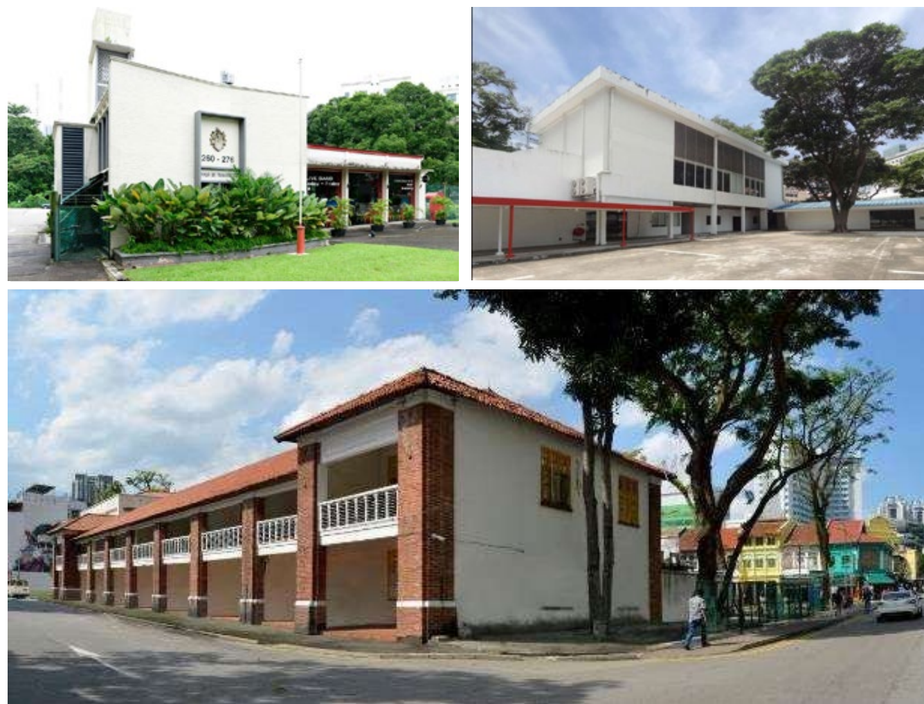
Iconic places such as the Bukit Timah Fire Station, 30 Maxwell Road and the Hinduo Road area will be opened next for proposal under the RSVP programme

Sultan Gate is envisaged to be a focal point of activity and community node in the heart of the Kampong Glam Historic District, which itself is a vibrant melting pot of heritage and culture. The area, which was designated as a conservation area in 1989, comprises of prominent landmarks of historical and architectural significance such as Sultan Mosque and the Malay Heritage Centre (former Istana Kampong Glam), together with more than 600 two to three-storey conserved shophouses. The establishment of a new point of interest in the area will encourage more people to visit and, in turn, help increase the flow of human traffic at Baghdad Street and Kandahar Street.