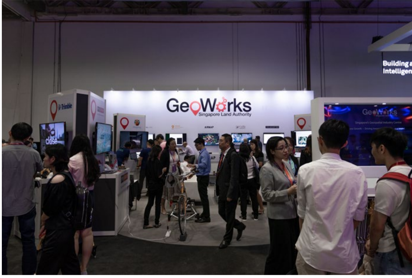
The GeoWorks booth showcased geospatial technologies such as the illumIn8, a data visualisation and exploration tool by GeoSpock