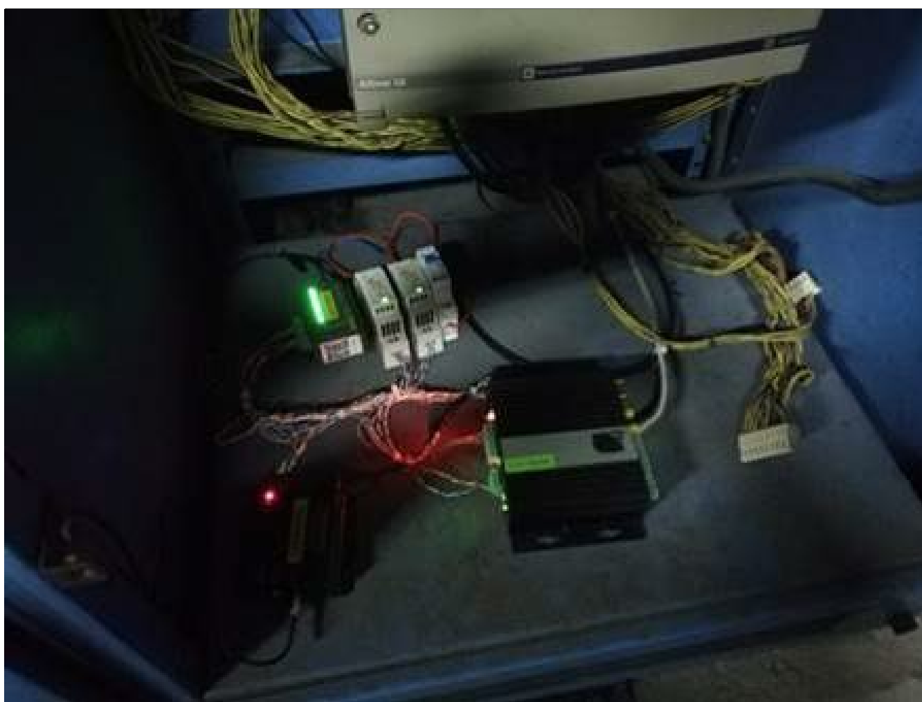
IoT is a system where interrelated computing devices, mechanical and digital machines have the ability to transfer data over a network without requiring human-to-human or human-to-computer interaction

The IoT system also sends automated alerts and collects data for analytics to help the C&W team predict potential breakdowns. This is particularly important as it allows for early detection and rectification of defects before the defects escalate into major incidents, thus allowing for cost savings as the need for major repairs is reduced. Repairing and resolving maintenance issues in advance will also save time, since minor defects can be fixed significantly faster compared to major defects.