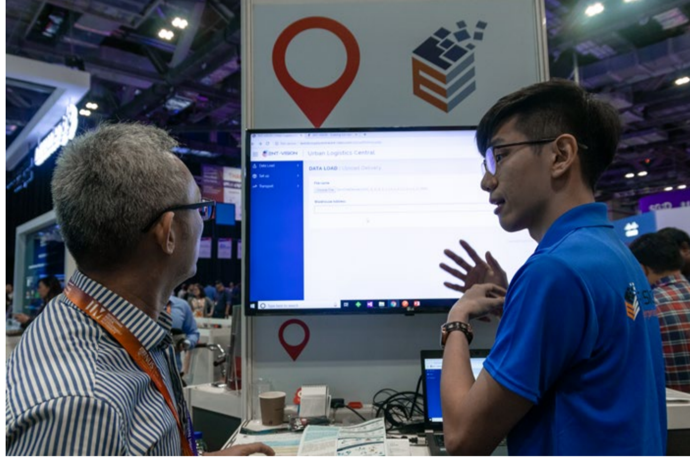
Ent-Vision's Urban Logistic Consolidation Hub is a collaborative network that connects various logistic service providers with each other in order to consolidate logistical tasks and optimise transport resources

Nonetheless, he felt that organisations are increasingly aware of the potential of geospatial data. "They were, in fact, interested to incorporate them into their companies. Hopefully, this will then lead to greater enthusiasm about geospatial data in our society," he added.