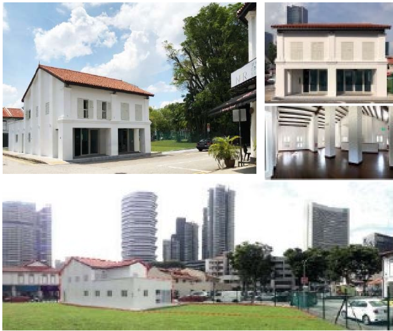
The recently restored 45 Sultan Gate is now open for proposals under the RSVP programme

RSVP allows for business owners, architects and designers an opportunity to test creative business concepts as to how they can enhance the visitor experience and add value to the area. This will help State-owned spaces in key selected precincts to be turned into more than just attractive places but also able to benefit the local community, encouraging interactions and bonding.