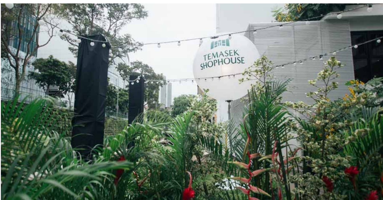
An outdoor garden on the first floor houses 27 species of plants that provide a safe haven for urban wildlife

Sustainability is a key feature of the structure’s design, from the entrance where a Green Wall houses 27 different varieties of plants, to the interior housing a partner firm researching new ways to recycle waste.