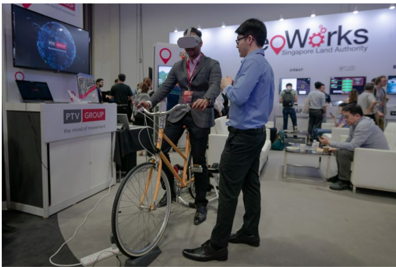
PTV Group showcasing the travel behaviour of pedestrians and vehicles on the street with the help of a bicycle, virtual environment, traffic micro-simulation and a game engine