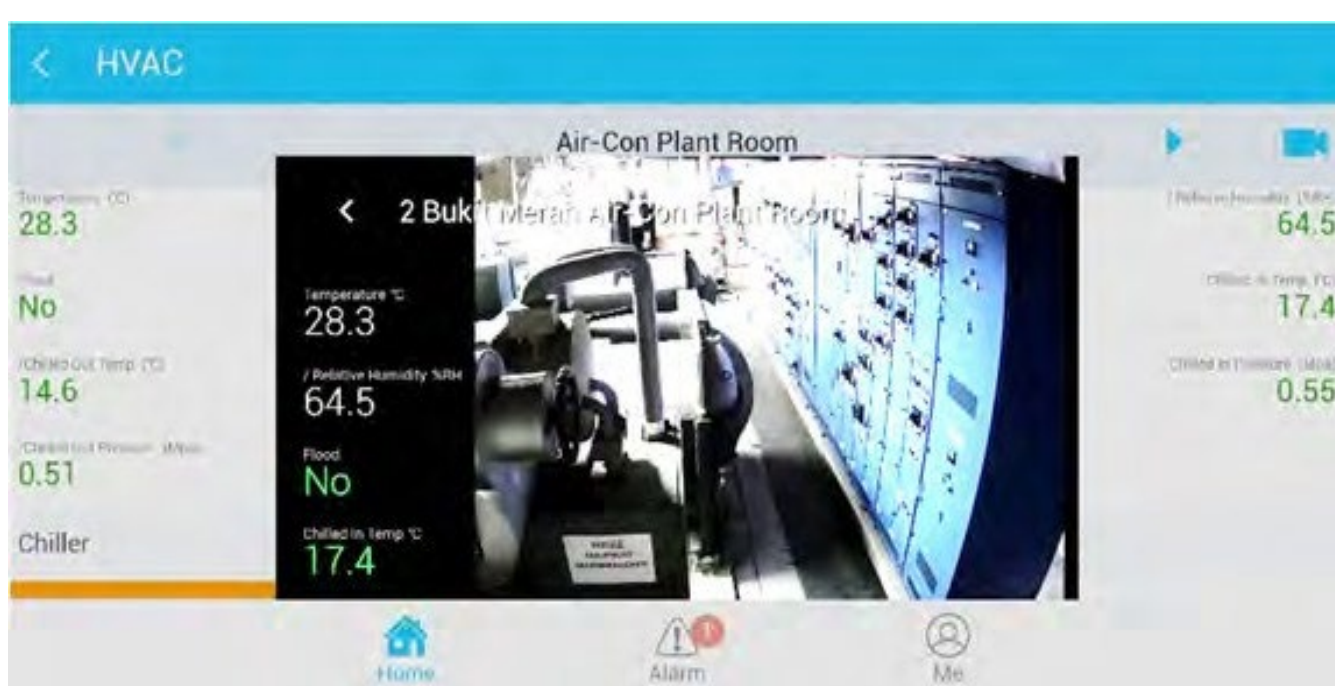
Smart self-monitoring analysis and reporting technology has enabled the team to react promptly to contingencies and improve response times by at least 50%

55 different sensors have been installed to capture readings and data from various critical systems such as air conditioning, plumbing, fire protection, electrical and lighting, and provide the C&W team with real-time monitoring of the performance statuses. This has enabled the team to react promptly to contingencies and improve response times by at least 50%.