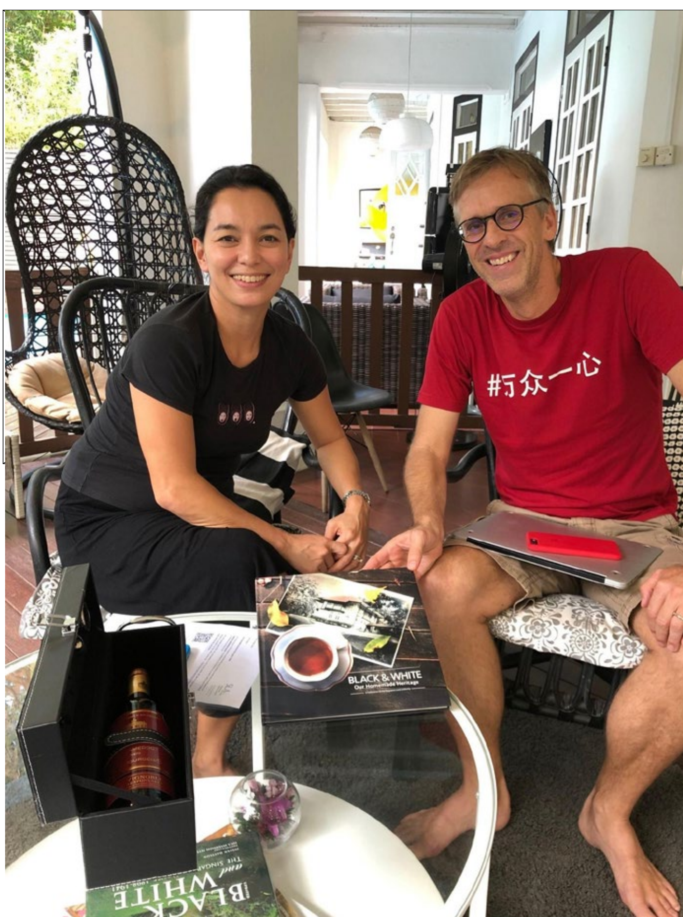
Tenants of 17 Malcolm Road together with the SLA Black & White Coffee Table Book

Said one tenant from Seton Close, "We have been very impressed by all our interactions with SLA and the service is superb. We have even mentioned to our friends of the excellent service that we have received."