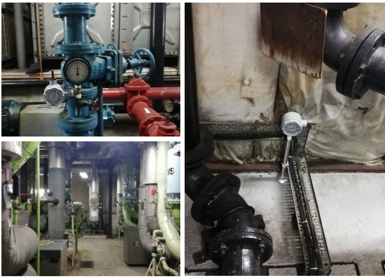
Sensors installed in the area can capture readings and data from temperature to water pressure so as to help the C&W team predict potential breakdowns